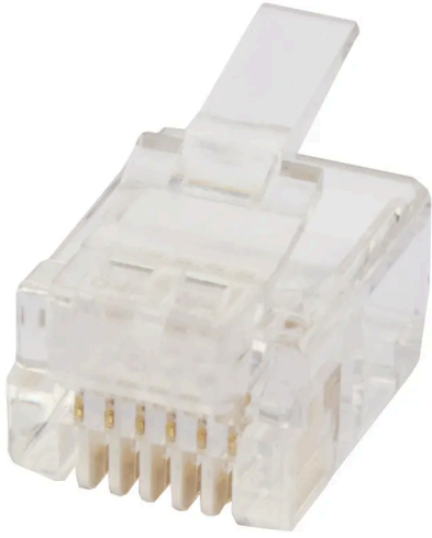
Plug RJ12 6P6C Round Stranded UTP 10PK

Item Number: 0666RST-X Packaging Unit: 1 / each