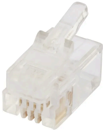
Plug RJ12 6P4C Flat Stranded UTP 100PK

Item Number: 0664FST-C Packaging Unit: 1 / each