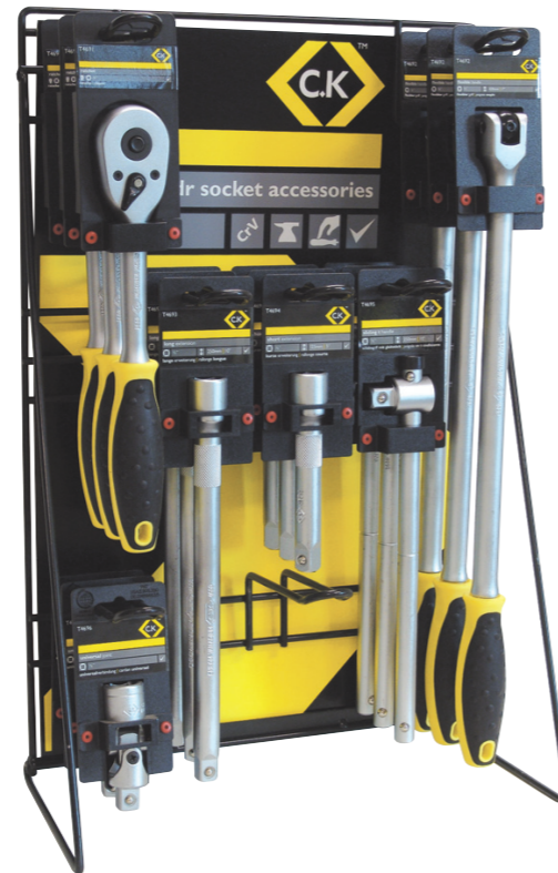
Socket accessory bar - 1/2" drive

CONTENTS: 3 x ratchet handle. 3 x sliding t-handle. 3 x flexible handle. 3 x long extension. 3 x short extension. 3 x universal joint.