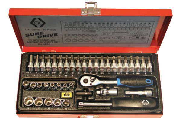
Socket set - 39 Piece 1/4" drive metric

CONTENTS: 45 tooth ratchet handle. 1 x socket, sizes: 4, 4.5, 5, 5.5, 6, 7, 8, 9, 10, 11, 12, 13 & 14mm. 1 x hexagon socket bit, sizes: 3, 4, 5 & 6mm. 1 x tamperproof TX socket bit, sizes: 8, 10, 15, 20, 25, 27, 30 & 40. 1 x socket bit, slotted, sizes: 4, 5.5 & 7mm; PZ, sizes: 1, 2 & 3; PH, sizes: 1, 2 & 3. Short extension. 1/4" drive handle. Universal joint. Hex to 1/4" drive adaptor.