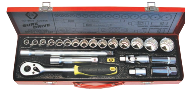
Socket set - 22 Piece 1/2" drive metric

CONTENTS: 45 tooth ratchet handle. 1 x socket, sizes: 10, 11, 12, 13, 14, 15, 16, 17, 18, 19, 22, 24, 27, 30 & 32mm. 1 x long reach socket, sizes: 16 & 21mm. Long extension. Short extension. Universal joint. 3/8" drive adaptor/t-handle adaptor.