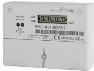
ECA2 c/w standard cover