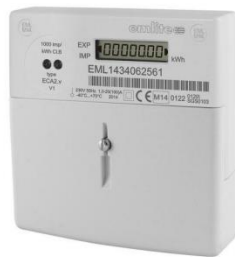
ECA2 c/w extended cover