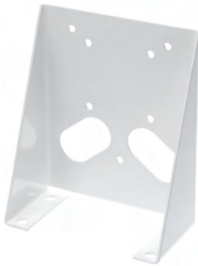
FMH/MFBN Floor Bracket

With a flame retardant, low profile ABS plastic body or a robust steel facia plate version available as a special order item