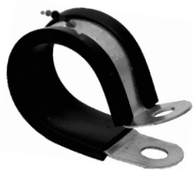
Plated Steel Fixing Clip