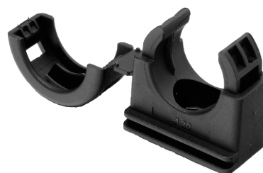
Nylon Conduit Clip