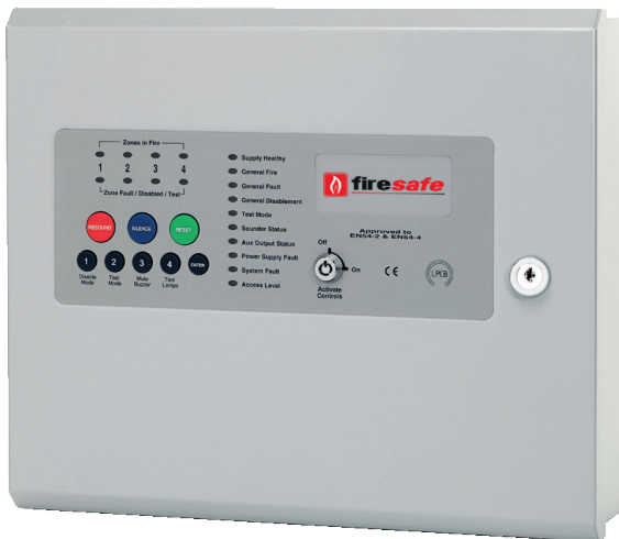
FSDG2 & FSDG4