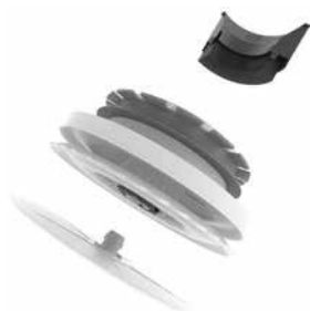
ComfoValve Luna S125, exploded-view drawing