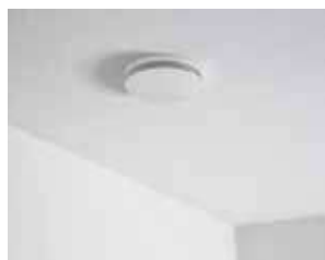
ComfoValve Luna S125, ceiling installation