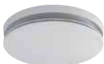
ComfoValve Luna S125