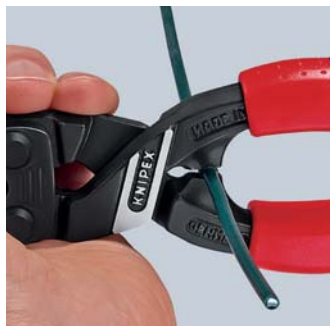
71 31 200/71 32 200/71 32 200 T With gripping surface below the joint for gripping and pulling wires with a diameter as from 1 mm