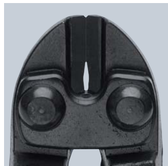
71 31 200/71 32 200/71 32 200 T The recess in the blade allows easier cutting of thicker wires, e.g. for anchor bolts in false ceilings