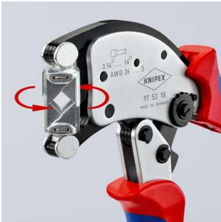
Crimp head can be rotated 360° for optimal accessibility, even in confined spaces