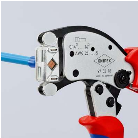
Uniquely flexible: connectors can be inserted in the rotatable crimp head from almost any position