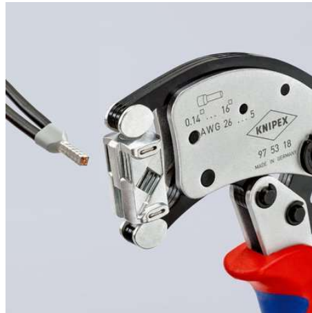
Twin wire ferrules up to 2 x 6 mm 2 can be crimped without adjustment