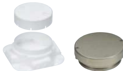
0 880 69