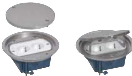
0 880 61 equipped with Mosaic mechanisms