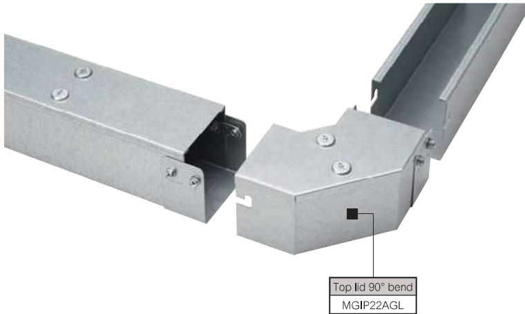
Top lid 90° bend MGIP22AGL