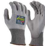
G-Force Silver Cut 5 Glove GDP138