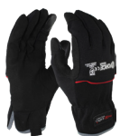
G-Force Synthetic Riggers Gloves GRS235