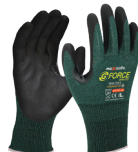
G-Force Ultra CUT B Glove GCT177