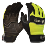
G-Force Synthetic Mechanics Glove GMV277