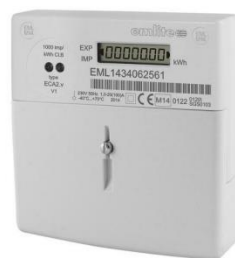
ECA2 c/w extended cover