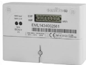
ECA2 c/w standard cover