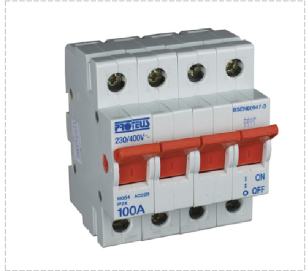
Device shown is 100A unit

Designation for triple pole Switch Disconnecter (Neutral being right-hand pole)