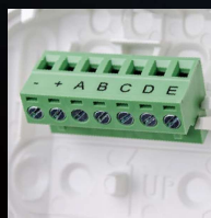
Adjustable terminal block