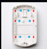
Flexible mounting points