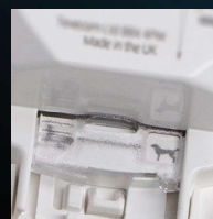
EN certified selectable pet immunity option