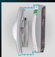
Front-loaded fully sealed electronics