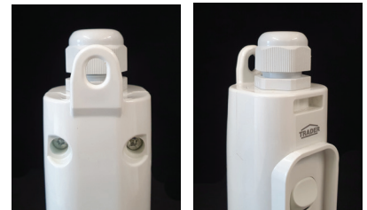
Eyelet loop at back for hanging purposes