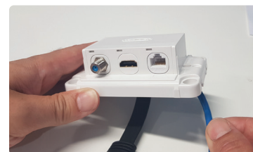
View shows assembly where plate has been completely clipped in ready for installation.