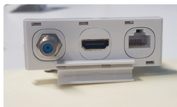
Jack clip in plate comes separate for easy installation and termination