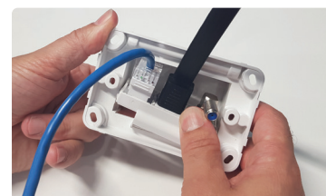
Pre-assembled and terminated plate can be rotated into position and clipped into place.