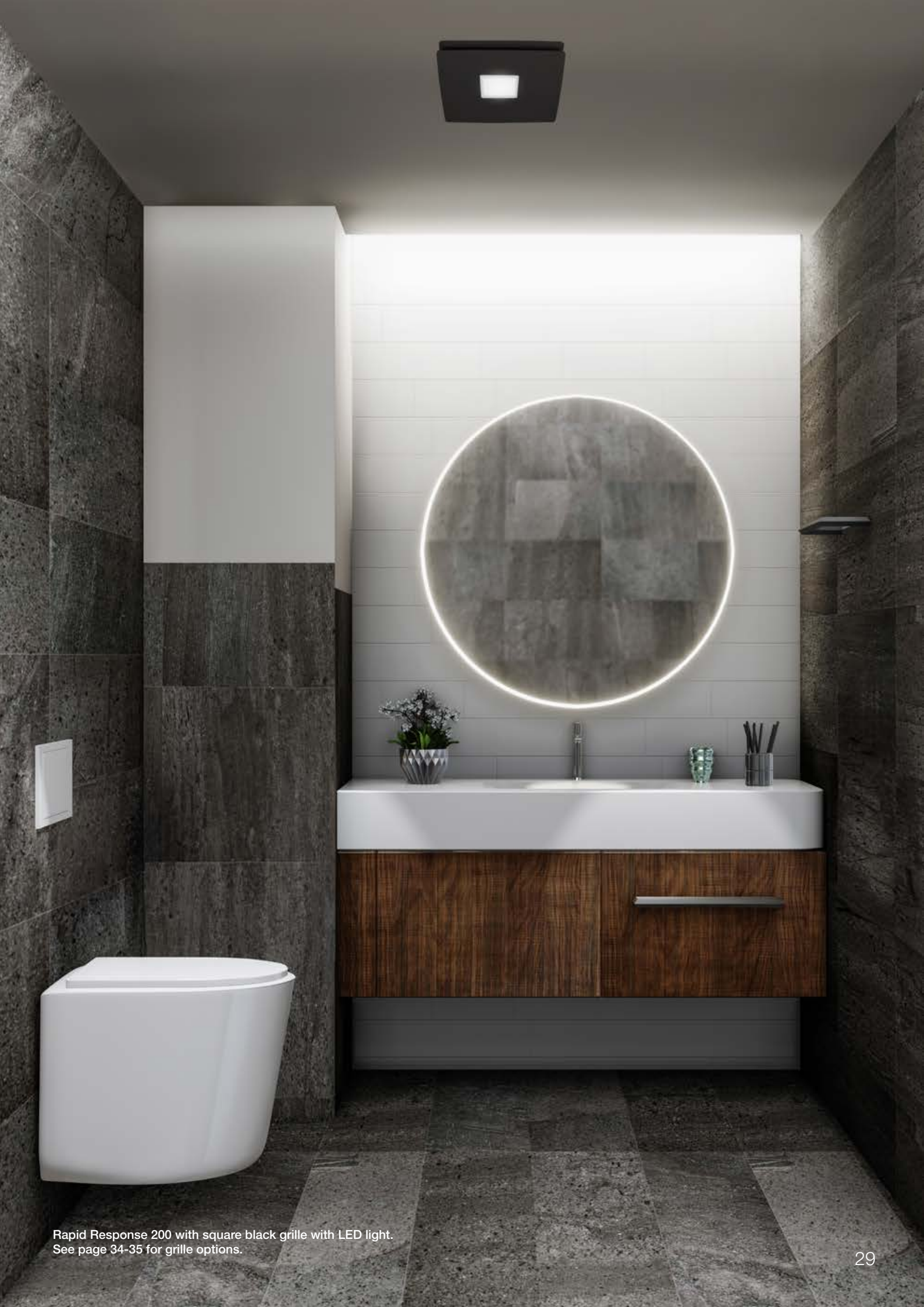
Rapid Response 200 with square black grille with LED light. See page 34-35 for grille options.