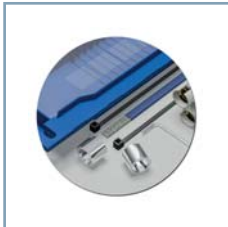
Cable retention clamp & spring coil for SWA Cables